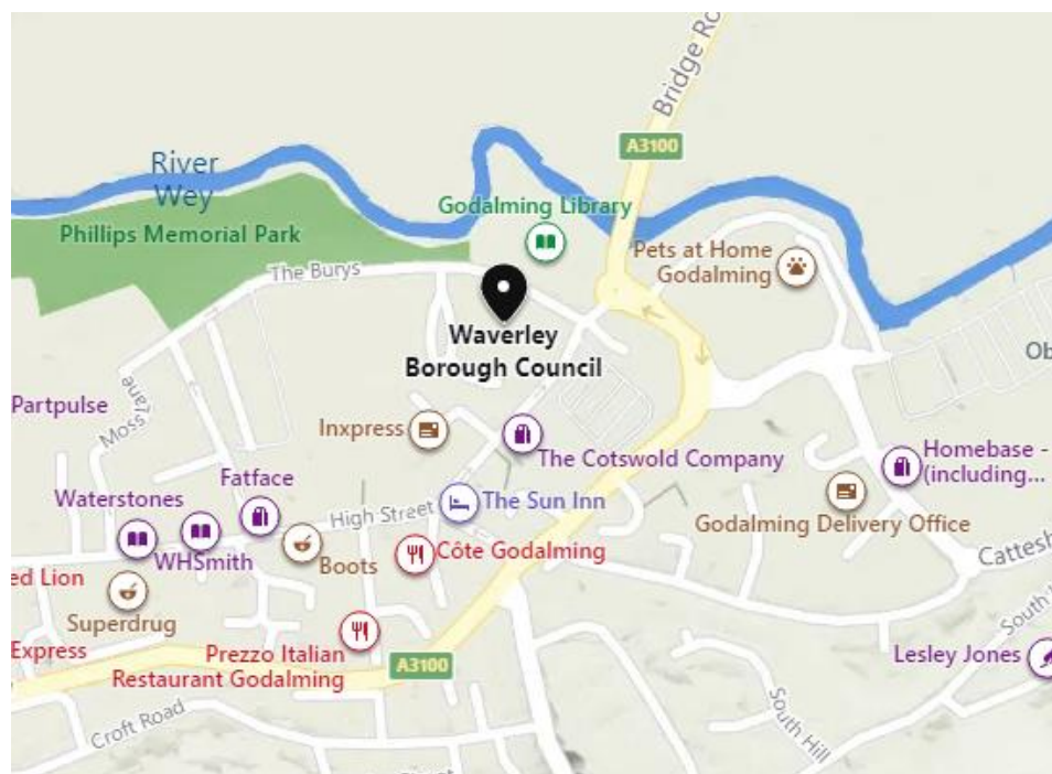
Map showing the location of the main offices for Waverley Borough Council and local shops and facilities

We are located just by the High Street opposite Waitrose and within 10 minutes' walk of Godalming station. We are also in easy reach of the A3: