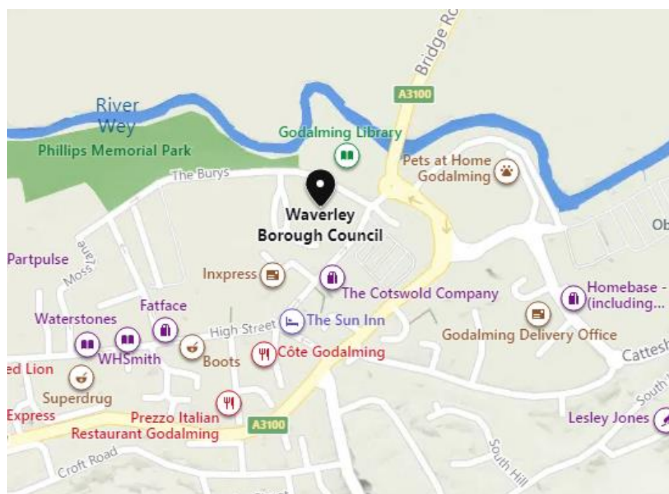
Map showing the location of the main offices for Waverley Borough Council and local shops and facilities

We are located just by the High Street opposite Waitrose and within 10 minutes' walk of Godalming station. We are also in easy reach of the A3: